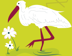
CARY STATE FOREST