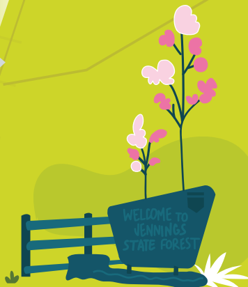
JENNINGS STATE FOREST